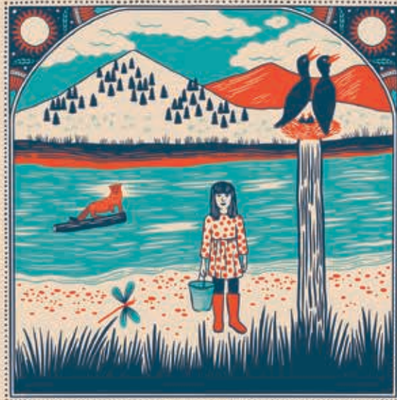
illustration by Kelley Wills reprinted with permission from The Mighty River by Ginalina (Peppermint Toast Publishing)