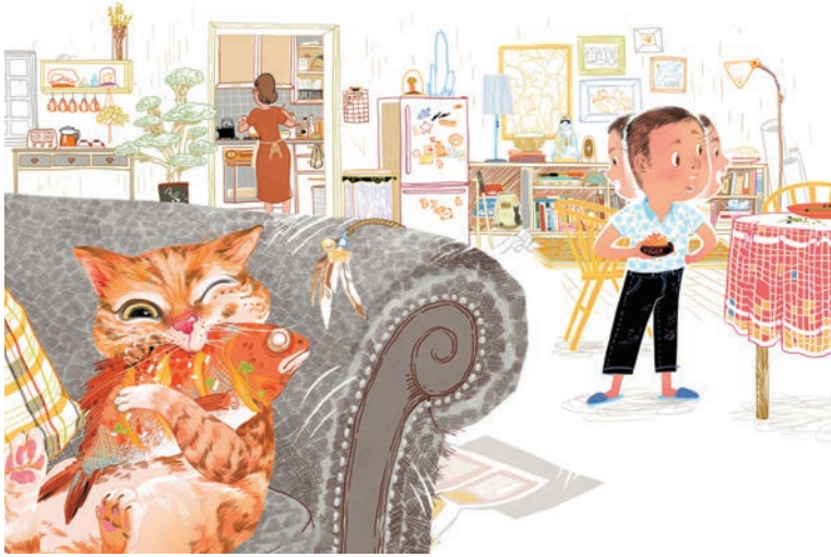
illustrations by Yuke Li reprinted with permission from The Tiger in My Yard Written and illustrated by Yuke Li, Self-Published