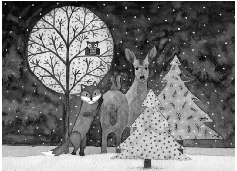
illustration by Colleen Sgroi reprinted with permission from Mindful Moon by Ann Biese, published by Pear Tree Publishing